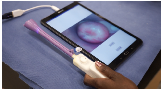
Figure 2: Callascope camera and introducer with mobile imaging application deployed on an Android tablet showing a cervix.

The Callascope is coupled with Mercy's second invention, an algorithm that uses machine learning to classify cervix images as normal or pre-cancerous. The algorithm can be deployed on a smartphone application and is based on objectively quantifiable cervix image features. Images from 134 colposcopy patients have shown that the algorithm has superior sensitivity and specificity compared to expert colposcopists. The Android application is HIPAA compliant for imaging and data storage.