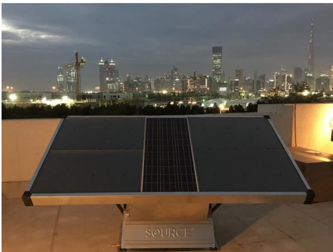
A SOURCE hydropanel installed in Dubai.

Near the end of 2014, Friesen founded Zero Mass Water, now SOURCE Global, a company that builds his hydropanel invention and installs it across the globe. The company's original name derives from the firm's culture and Friesen's approach to innovation, which revolves around becoming emotionally invested in problem statements, rather than in any one solution. Friesen and his team focus on the problem at hand — disparities in access to clean drinking water, for instance. Instead of tying themselves to any one solution to the problem, the team lets the data guide them. They are always prepared to pivot and shift their solution statement. In other words, they are "zero mass," or inertia-free, able to change their approach without any loss of momentum.