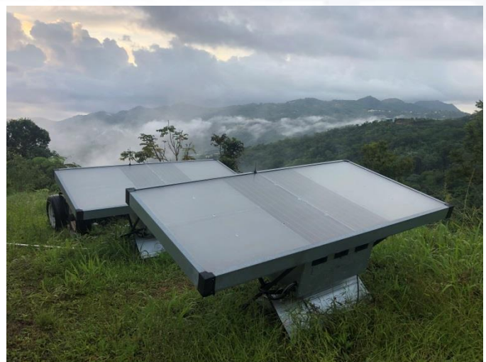
SOURCE hydropanels installed in Puerto Rico.

Differences in geography at home and abroad inspired Friesen’s innovation. While installing renewable battery systems with Fluidic Energy in Indonesia, which experiences approximately 10 feet of rainfall per year, Friesen pondered whether it would be possible to harness water similarly to how solar panels harness energy from the sun. Renewable energy would go beyond electricity in this case, loosening constraints on drinking water, the scarcest of fundamental resources. Friesen set out to efficiently, sustainably generate clean water for businesses, communities and people who need clean, safe, high-quality drinking water across the world and where it’s needed most, including his